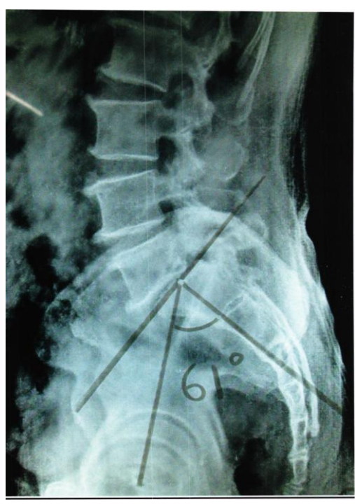
Fig. 2. Listhesis grade- grade 1 Mrs.E,50 yrs old Male, PIA-61°

The products used for this research are commonly and predominantly use products in our area of research and country. There is absolutely no conflict of interest between the authors and producers of the products