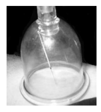
Fig. 1. Needle cupping

cup is applied over it. Usually, they use special technique to protect skin from burning by using a thin aluminum layer under the hot Moxa. Moxa is a dried Mugwort leaves used in Chinese medicine in a procedure called Moxibustion, a form of acupuncture. Observing patient during the procedure is very important because the patient is at risk of burn, which is the main disadvantage of this method.