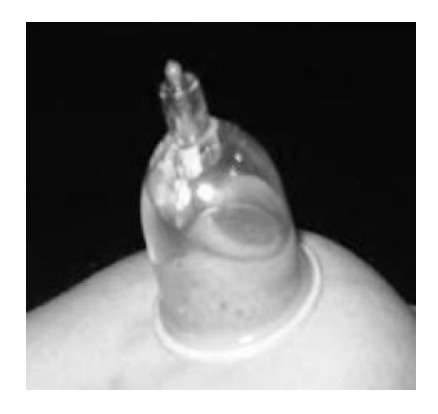
Fig. 2. Water cupping

Water cupping is done by using warm water inside the cup during cupping session. It involves filling a third of the cup with warm water. Whilst holding the cup close to the client with one hand, bring it close to the point to be cupped and insert burning cotton wool into the cup, then swiftly and simultaneously turn the cup onto the skin. When performed properly, no water spillage occurs [4]. (See Fig. 2) Water cupping is especially beneficial for treating asthma and related conditions including dry cough [25]. But certainly not in the acute stages of these diseases. Water spillage is the main disadvantage of this method.