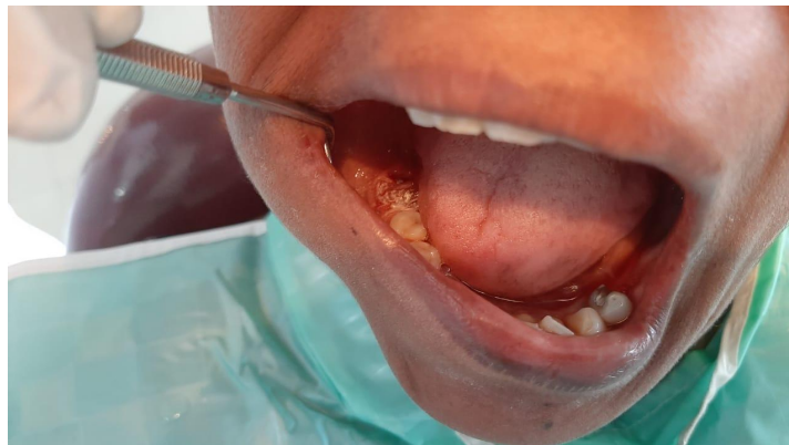
Image 1. Human amniotic membrane placed in the extracted socket of Lower right first molar (46)

This study is a pilot study conducted for a period of 6 months.