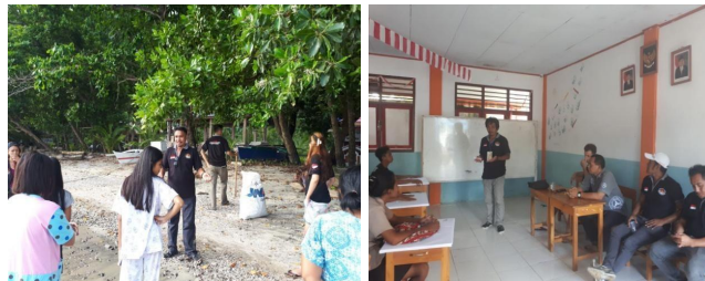
Fig. 4. Campaign to care for garbage and clean beaches at Talawid beach and SMK talawid