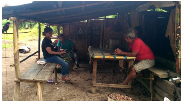
Fig. 1. Food stall on Lake Kapeta

The form of participation carried out by the community on Mahoro Island is the same as in Lake Kapeta, namely selling food. Mahoro Island is an island that is not inhabited. People who sell on Mahoro Island are local people who live near Mahoro Island. This food seller on Mahoro Island also provides tent rental, the price for a tent rental is Rp. 100,000 per tent. Another form of participation that is carried out is maintaining cleanliness on Mahoro Island.