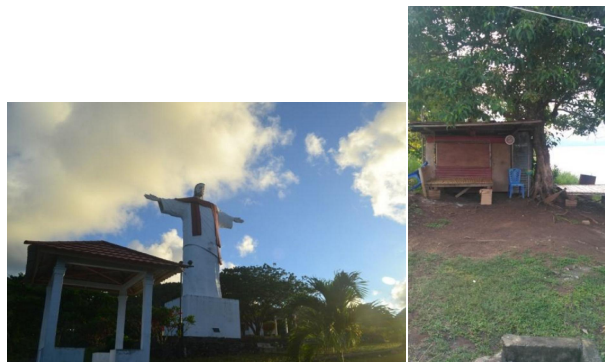
Fig. 3. Blessing Lord Jesus Statue

Forms of local community participation are also in the form of promoting Siau Island from the internet or social media, namely blogs and Facebook. This is an effective way to promote through social media. The name of the blog page that is owned is exploresiau.blogspot.com and the name of the Facebook page is Visit Siau Island. Through social media, blogs and Facebook can open many networks for information from outside the region and outside the country.