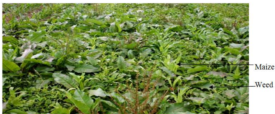
Fig. 1. Zea mays growing in the presence of established weeds

These chemicals may limit the growth of established plants or germination and growth of seeds and seedlings. Allelopathic interactions can be quite species-specific and can go both ways [21,22].