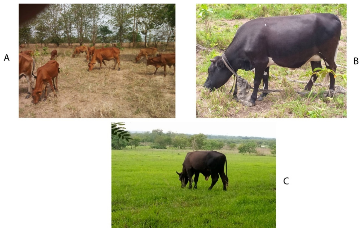
Figure 1. Cattle breeds (A = Azawak; B = Muturu; C = Girolando)