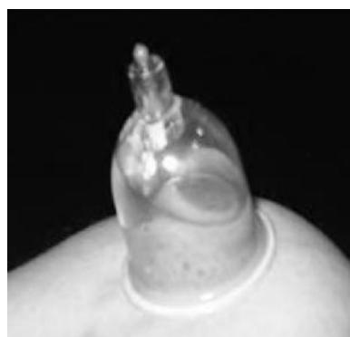
Fig. 2. Water cupping

Water cupping is done by using warm water inside the cup during cupping session. It involves filling a third of the cup with warm water. Whilst holding the cup close to the client with one hand, bring it close to the point to be cupped and insert burning cotton wool into the cup, then swiftly and simultaneously turn the cup onto the skin. When performed properly, no water spillage occurs [4]. (See Fig. 2) Water cupping is especially beneficial for treating asthma and related conditions including dry cough [25]. But certainly not in the acute stages of these diseases. Water spillage is the main disadvantage of this method.