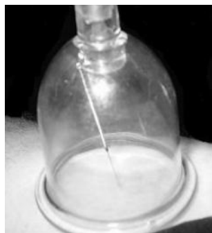
Fig. 1. Needle cupping

cup is applied over it. Usually, they use special technique to protect skin from burning by using a thin aluminum layer under the hot Moxa. Moxa is a dried Mugwort leaves used in Chinese medicine in a procedure called Moxibustion, a form of acupuncture. Observing patient during the procedure is very important because the patient is at risk of burn, which is the main disadvantage of this method.