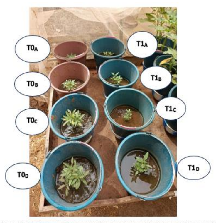
T0 : Control ; T1 : contaminated soil not amended. Each treatment is repeated in four pots. The letter A, B, C, D indicate the replicates of each treatment.

The value in the table has the mean of 4 replicas ± the standard deviation; T0: Uncontaminated soil not amended; T1: Contaminated soil not amended; T2: Contaminated soil amended with 200 g of cow dung; T3: Contaminated soil amended with 200 g of compost; T4: Contaminated soil amended with 100 g of cow dung and 100 g of compost. The letters a, b and c indicate the significant differences between the means according to the Tukey test with a confidence level of 95% and a significance level of 0.05.