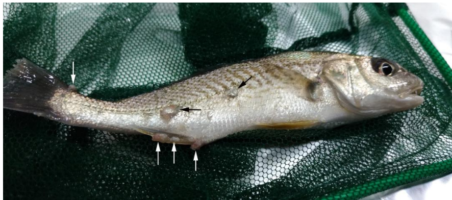
Fig. 1. Specimen of Micropogonias furnieri with warty aspect nodular lesions in the tegument and fins (arrows)

The animals were euthanized in benzocaine hydrochloride (300 mg/L) and the autopsy was performed for material collection for histopathological analysis. The skin lesions fragments were fixed in 20% buffered formalin. The tissue samples were subjected to histological processing (LEICA TP 1020) and included in paraplast. The tissue sections were performed to a thickness of 5 \mu in the microtome Leica RM2245. The histological sections were stained with hematoxylin and eosin and periodic acid-Schiff (PAS).