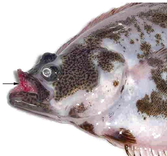
Fig. 2. Specimen of Paralichthys orbignyanus nodular, warty aspect and congestive lesions in the oral region (arrow)