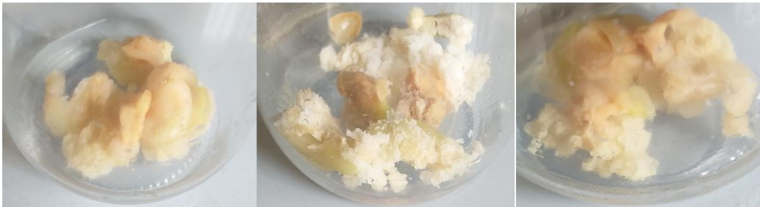
Fig. 1. Callus culture of B. aegyptiaca at 0.5 BAP + 1.0 2, 4-D + 1.0 NAA

2, 4-D gave higher formation of callus on MS media which is in line with report of this studies. The phytochemical analysis of the plant extracts indicates the presence of saponins, tannins, glycosides, oxalate, and steroids in the test sample. Tannin; a class of polyphenol compound present in these plant materials is an inhibitor of microbial growth and also, with an astringent property [24]. Steroids have strongest antimicrobial property and are essential compound for synthesis of sex hormones. Some of these phytochemicals tends to inhibit the binding of microbes on host cell surface membranes and act as potential antiadhesive agents [25].