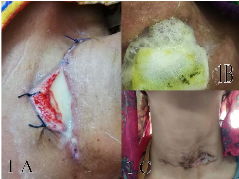
Fig. 1A. Initial presentation of wound with discharge, 1B. Salivary discharge from wound, 1C. Healed wound

In the second week when the wound was clean, we proceeded with rigid esophagoscopy under general anesthesia to determine the proximal edge of esophageal injury. A defect in the anterolateral wall of the cervical esophagus about 2.8 cm in length at C 5 and C 6 level was identified, with only the posterior esophageal wall intact. The proximal edge was marked with a prolene stitch and the defect was carefully stented with a nasogastric tube.