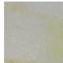
Fig. 8. Test (72 hours)