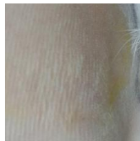
Fig. 2. Test (1 hour)