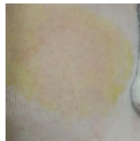
Fig. 4. Test (24 hours)