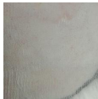
Fig. 1. Control (1 hour)