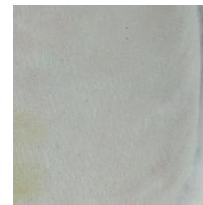
Fig. 7. Control (72 hours)