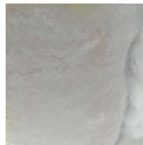
Fig. 3. Control (24 hours)