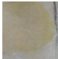
Fig. 6. Test (48 hours)