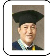
Universitas Negeri Padang.